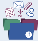
"Any and All" Document Management